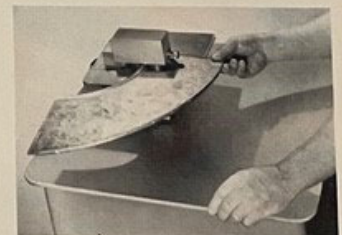
Punch thumb nail button punch.